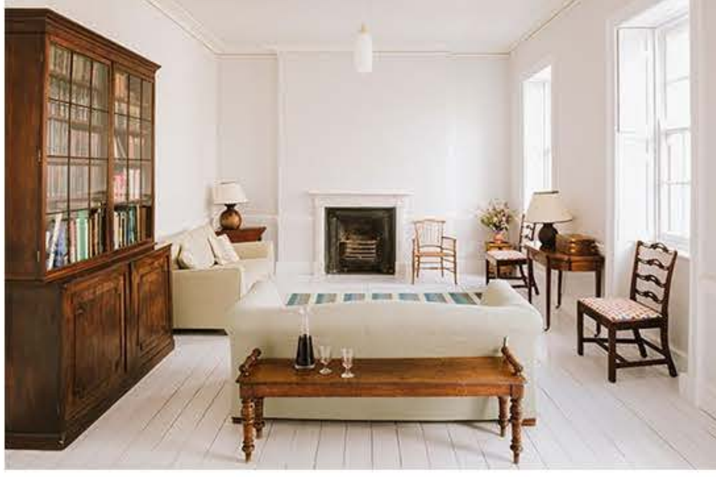
The drawing room at Chapel House PZ, a boutique hotel in Penzance, England.

Located in the western portion of England's Cornwall peninsula, the town of Penzance is famous for its Mazey Day celebrations and the Golowan Festival, which take place every June. Within close proximity to the artistic culture of Newlyn and the breathtaking coastal area of Penwith, Penzance is the perfect base for exploring the idyllic region.