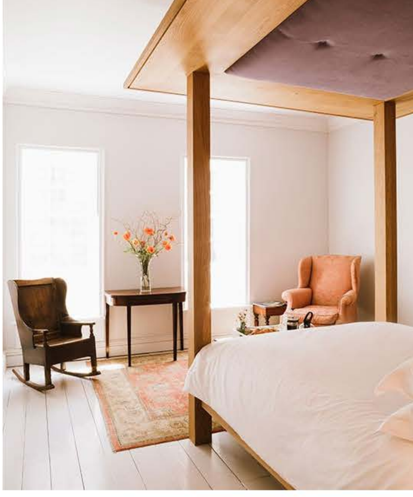
Whitewashed floors and a custom-made four-poster in a light-filled guest room.

The interiors, a vibrant mix of historic and modern, feature antiques and original elements—such as the windows and flagstone flooring—paired with streamlined, contemporary pieces in bold shades. Whitewashed surfaces, meanwhile, keep things fresh. Touches of gray, blue, and green recall the English Channel, and a rotating collection of contemporary works from the nearby Newlyn School of Art hangs in the public spaces. All six of the light-filled rooms have sea views, custom-made beds, contemporary furnishings, alpaca throws, and soaking tubs.