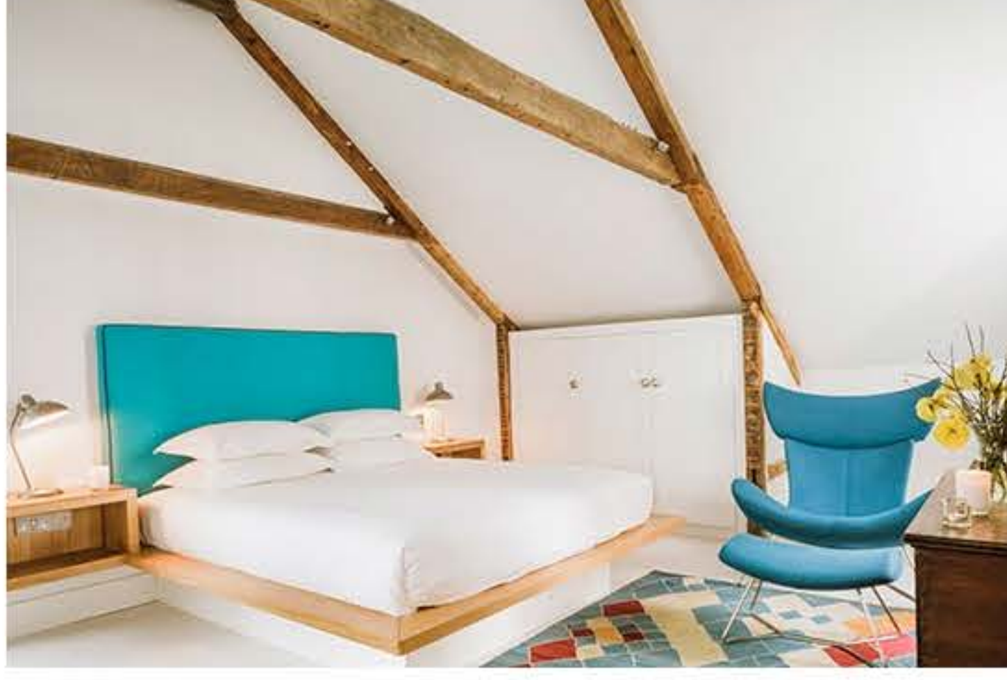
A rustic-chic guest room featuring a beamed ceiling and modern furnishings.

The interiors, a vibrant mix of historic and modern, feature antiques and original elements—such as the windows and flagstone flooring—paired with streamlined, contemporary pieces in bold shades. Whitewashed surfaces, meanwhile, keep things fresh. Touches of gray, blue, and green recall the English Channel, and a rotating collection of contemporary works from the nearby Newlyn School of Art hangs in the public spaces. All six of the light-filled rooms have sea views, custom-made beds, contemporary furnishings, alpaca throws, and soaking tubs.