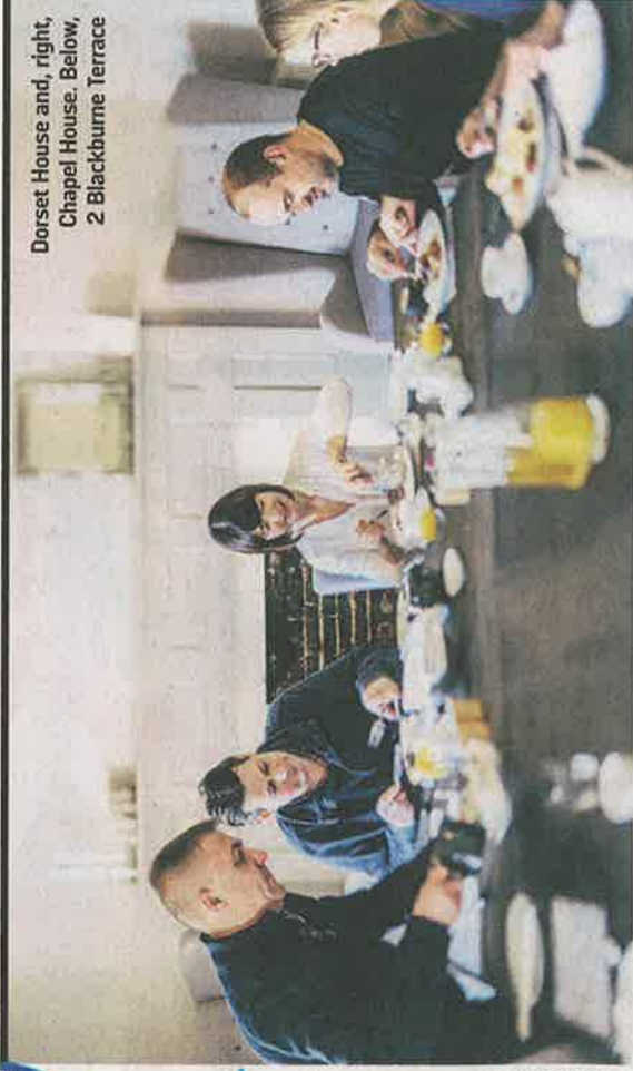
Dorset House and, right, Chapel House. Below, 2 Blackburne Terrace