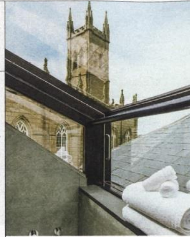
Left Chapel House, Penzance

Room to book: Bedroom Two boasts glorious views of St Michael's Mount from your egg-shaped bath. It also has a wood-burning stove. Doubles from £150 ( chapelhousepz.co.uk ).